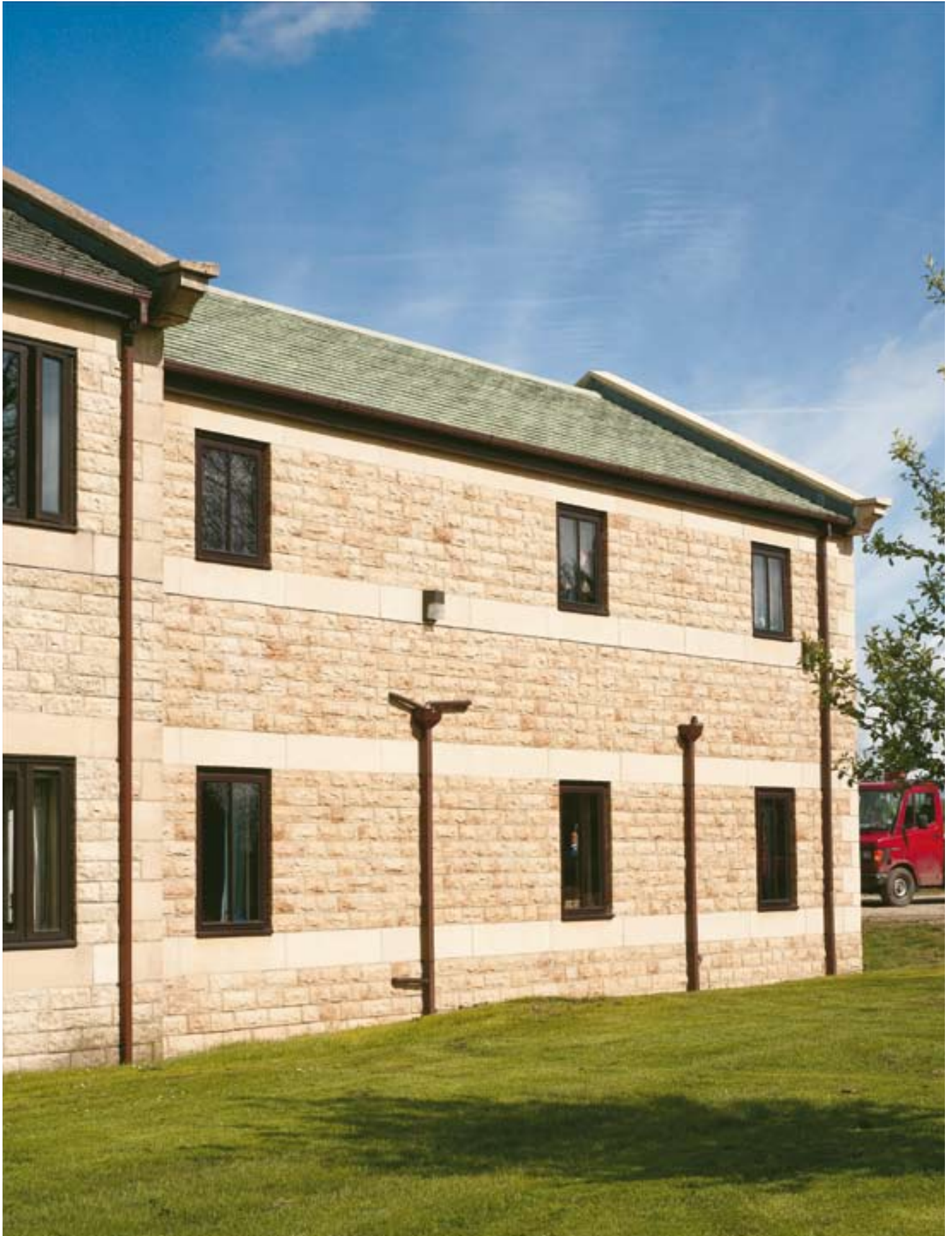
Barnard Castle School