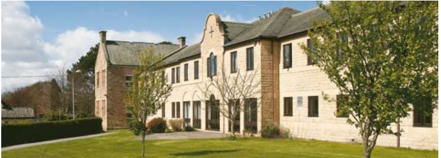
Barnard Castle School

Founded in 1883 as the North Eastern County School, later renamed Barnard Castle School, is today a leading independent boarding and day educational facility for boys and girls from pre-school age through to the age of 18. Teaching over 550 pupils in its Senior School and 140 children in the Preparatory School, the site needed to develop to offer pupils a further enhanced educational experience. This primarily took the form of increasing its boarding capacity to facilitate a growing number of pupils.