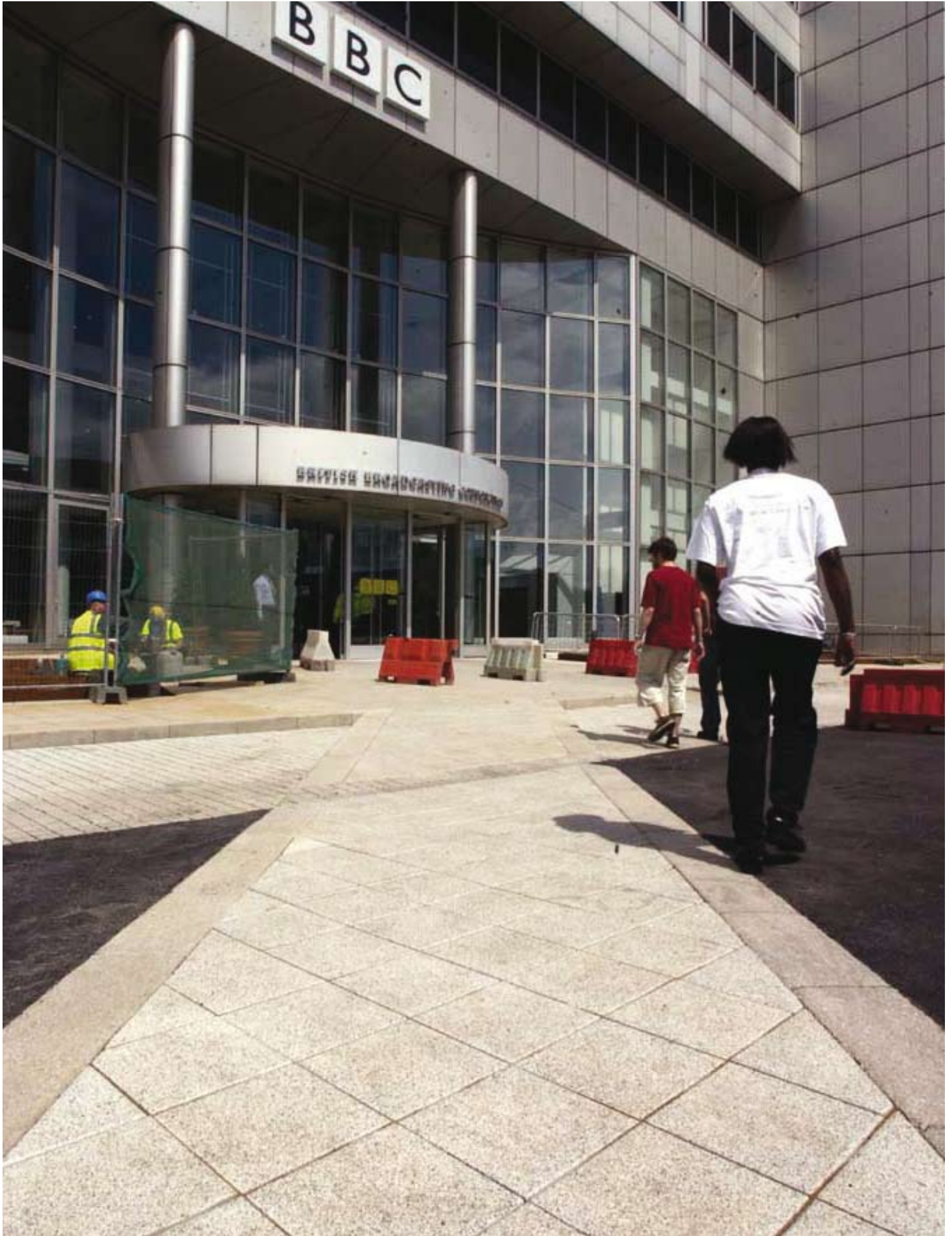
BBC Media Village, White City, London