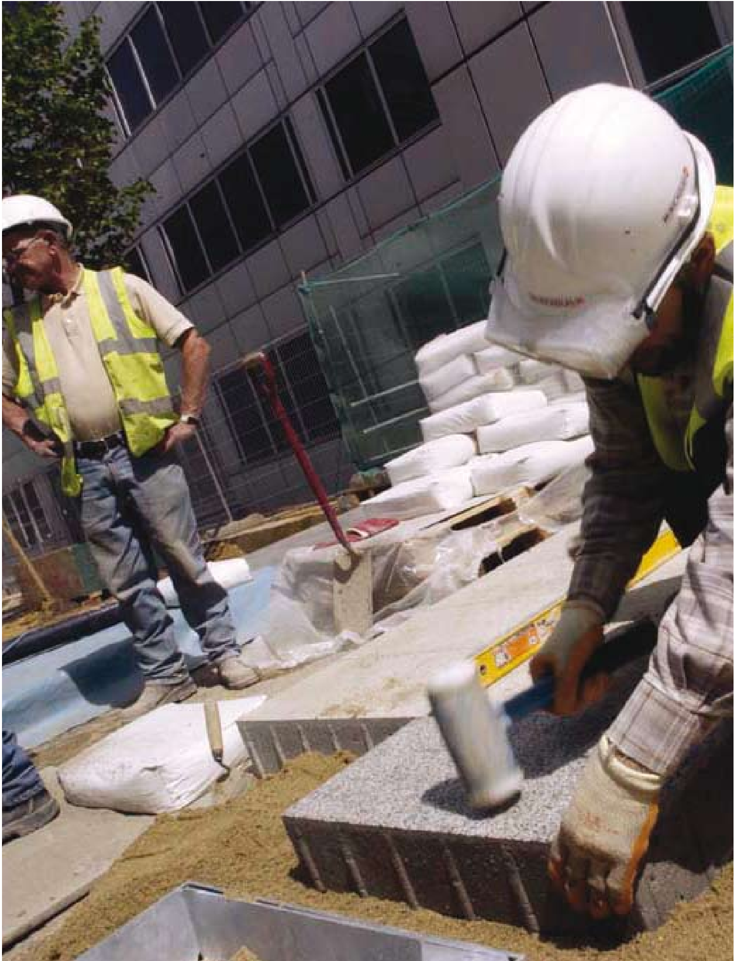
BBC Media Village, White City, London