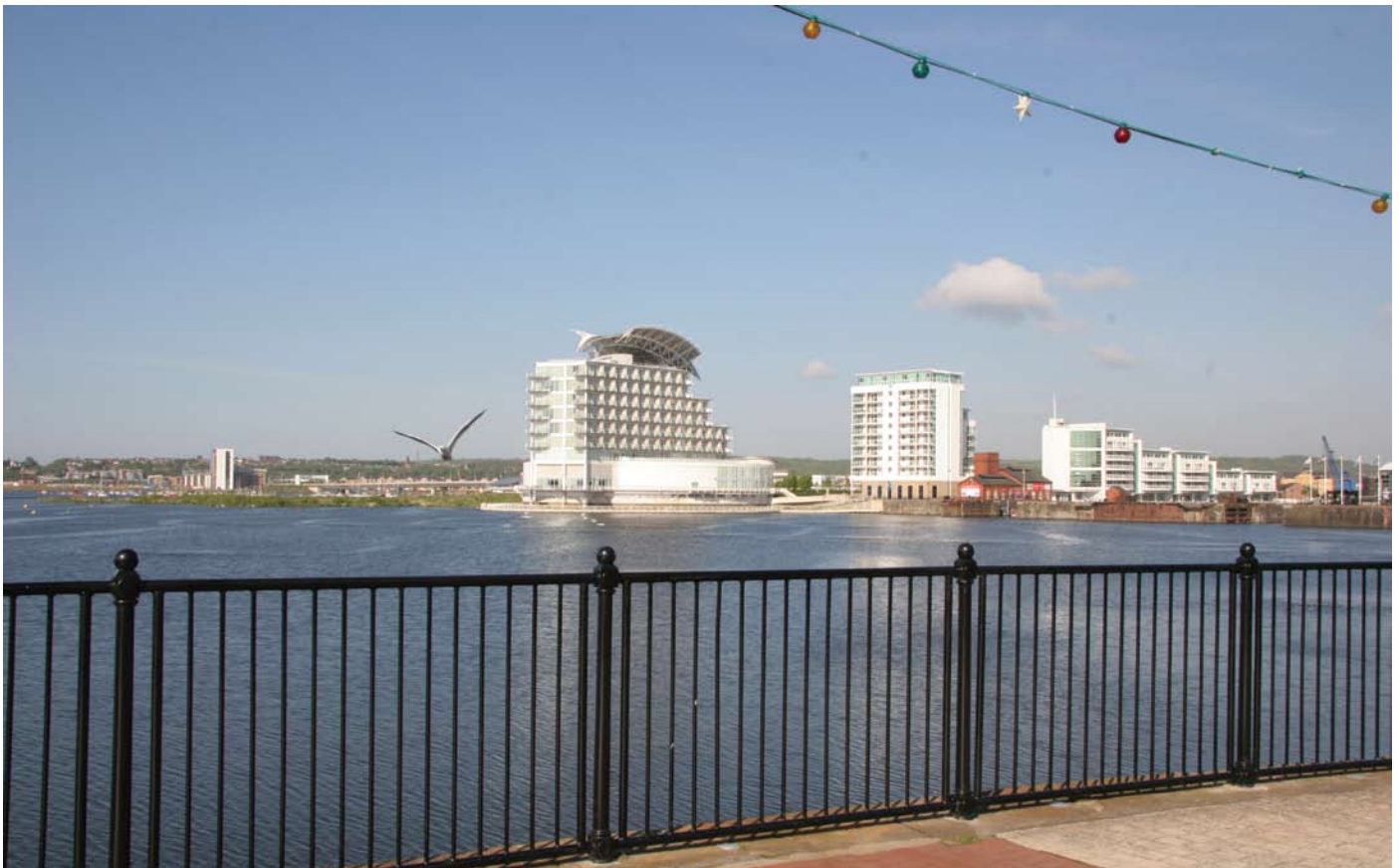
Bespoke Post and Panel System, Tiger Bay