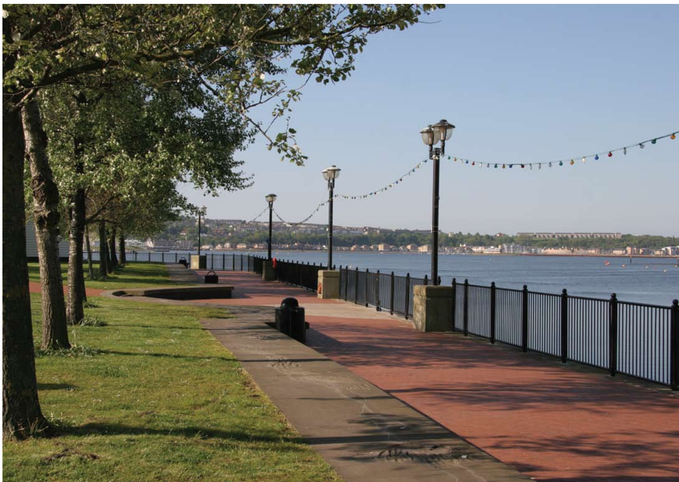
Bespoke Post and Panel System