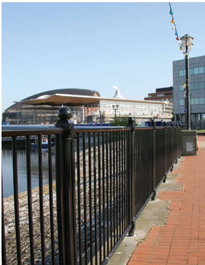
Bespoke Post and Panel System