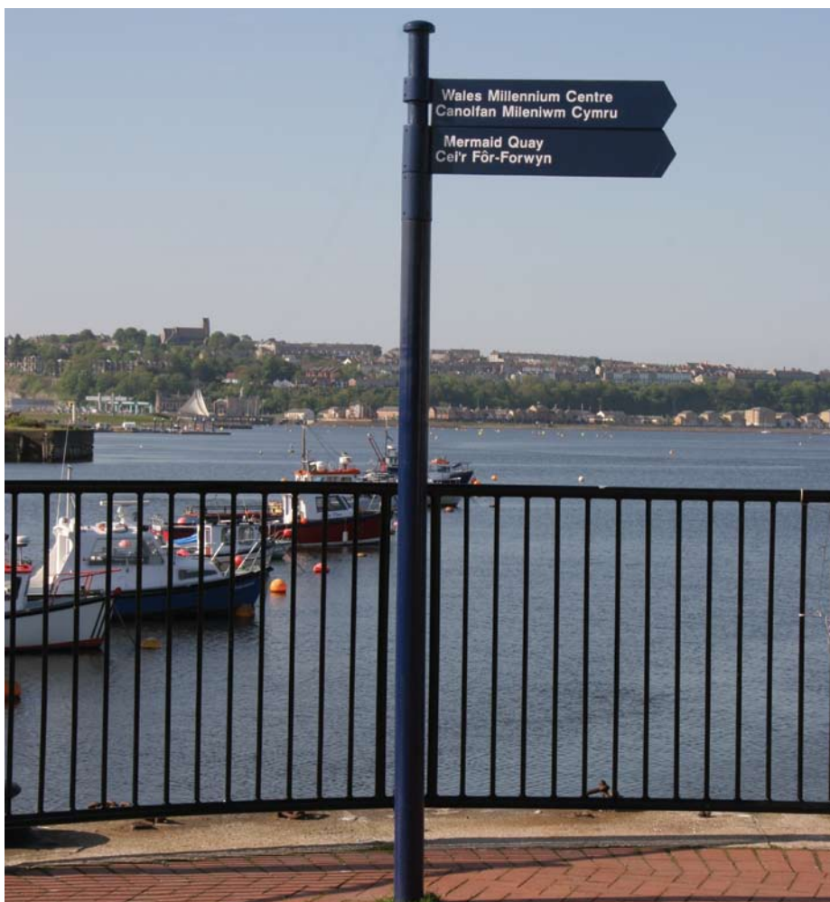
Ferrocast Stockport Fingerpost