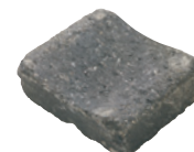
Drivesett Channel, Pennant Grey (PG)