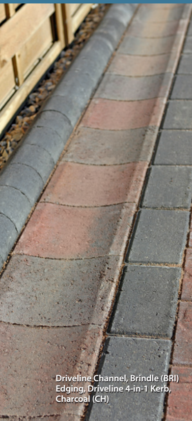
Driveline Channel, Brindle (BRI) Edging, Driveline 4-in-1 Kerb, Charcoal (CH)