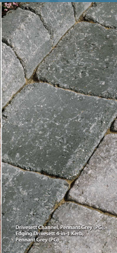
Drivesett Channel, Pennant Grey (PG), Edging Drivesett 4-in-1 Kerb, Pennant Grey (PG)