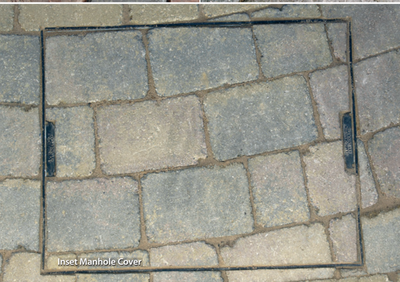
Inset Manhole Cover