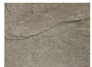
Pendle, Natural (N)