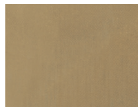
Richmond, Buff (B)