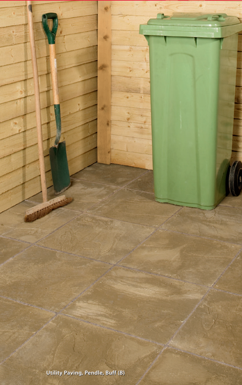
Utility Paving, Pendle, Buff (B)