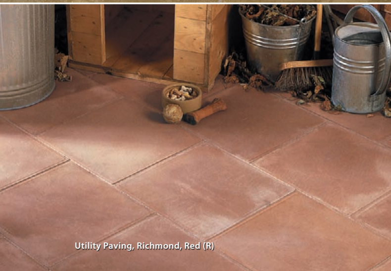
Utility Paving, Richmond, Red (R)