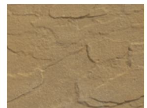
Pendle, Buff (B)