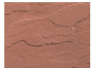
Pendle, Red (R)